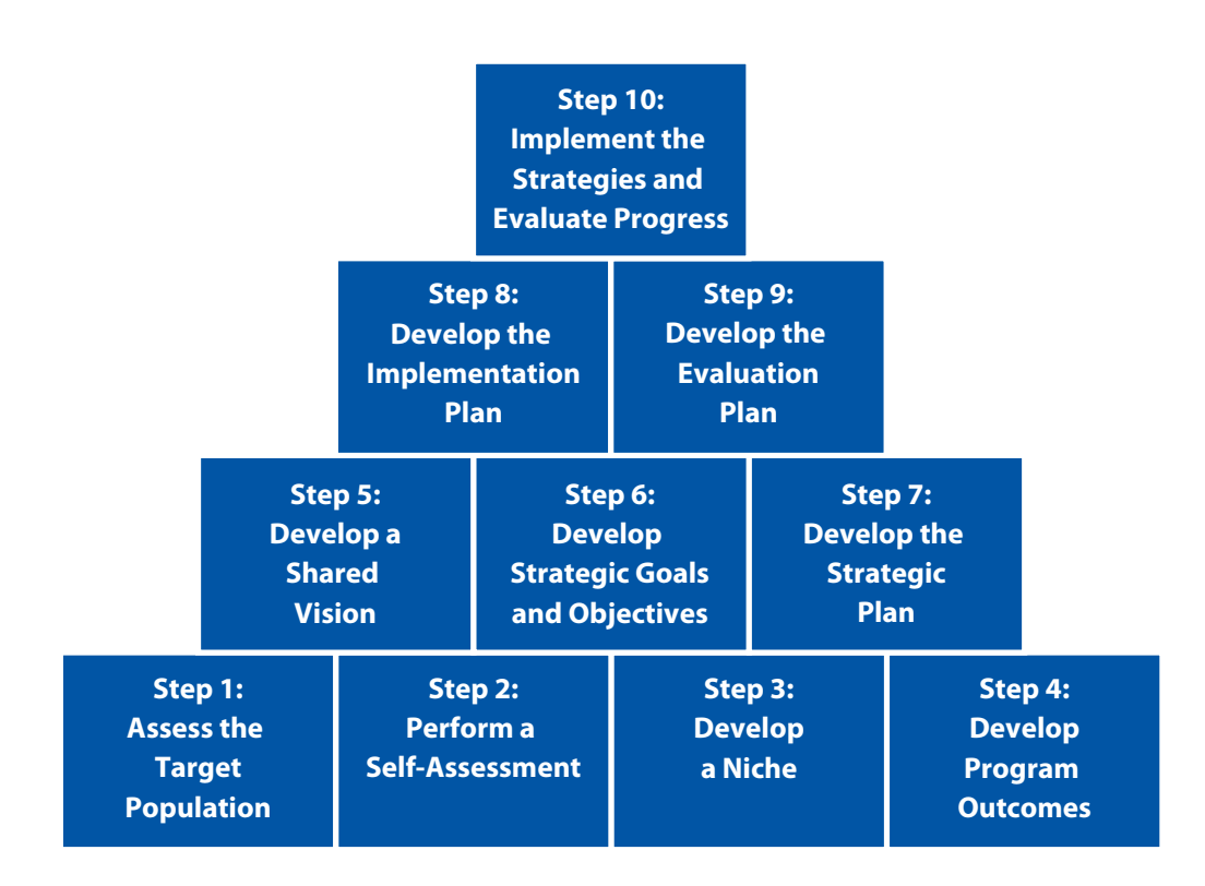
Figure 1 - Strategic Planning Pyramid